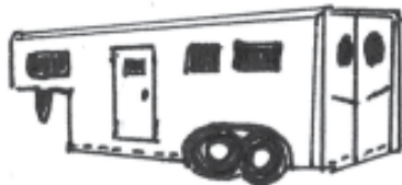
Load & Unload